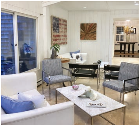
The Platinum Pebble provides a tranquil, adults-only romantic hideaway.