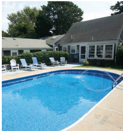
Allen Harbor Breeze Inn is a serene Cape escape, a true hidden treasure tucked away, where you can relax.

“What happens when you cross foodies with innkeepers? A Cape Cod vacation highlighted with a delicious start to your day! We love people and we love food. The chef is our innkeeper.”