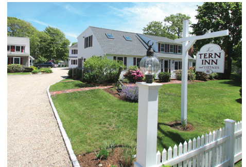
Spanning two acres, bed and breakfast Tern Inn offers a variety of rooms in the main inn, carriage house, and cottages.

These two innkeepers, Dan and Suzanne Edwards, had a Cape connection before becoming innkeepers. Dan was born in Provincetown and Sue is a washashore. They both moved to Harwich in 1969 but didn’t meet until 1973 – once married, they moved to Western Massachusetts but would frequently come and visit Sue’s parents in East Harwich. After staying at the Tern Inn one night in January 2015, they decided they wanted to buy it. This newly renovated inn with a coastal, comfortable, and immaculate feel is situated on almost 2 acres in a residential neighborhood – and within walking distance to one of the 21 Harwich beaches. The Tern Inn offers a variety of cozy accommodations, from rooms in the main inn and Carriage House to a small cottage community. It creates a quaint and charming atmosphere all on one property, and a full breakfast is offered each morn-