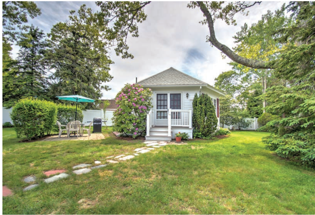
This unique hexagon shaped one-bedroom cottage at The Tern Inn features a comfortable queen plush mattress. Guests enjoy a well-deserved respite with all the amenities: bath with shower, flat screen TV, AC, fully equipped kitchen and outdoor dining space with gas grill.